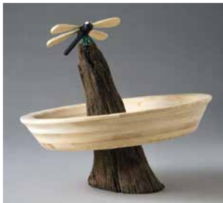
(Left) Butterfly Phoenix , 2015, Mangrove driftwood, spalted maple, African blackwood, oak burl, 18" x 8" (46cm x 20cm)