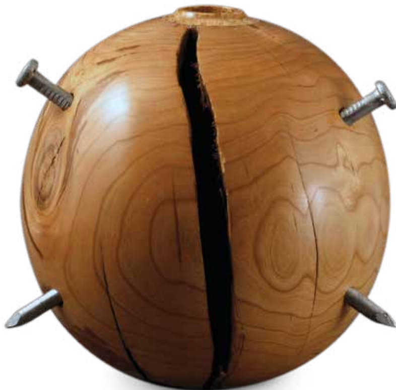
Derrick A. Te Paske , Desperate Measures: Spikes , 2005, Black cherry, cherry burl, landscaping spikes, 9" x 10" x 8" (23cm x 25cm x 20cm)