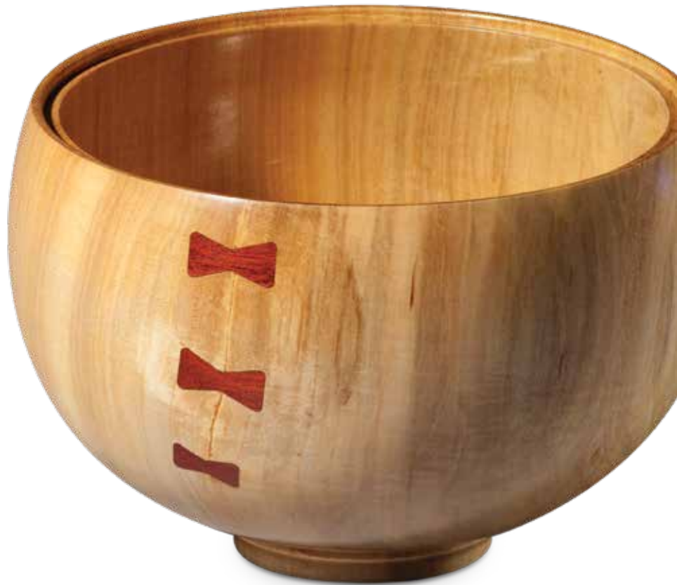
Dennis Belcher , Resurrection Series , 2010, Mineralized soft maple, padauk, 5" × 7" (13cm × 18cm)